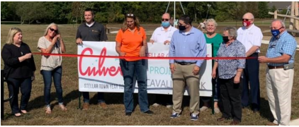
Two Stellar Project Projects Complete