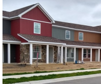
The Paddocks Housing Updates